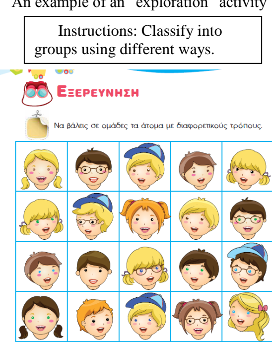
Figure 1 An example of an "exploration" activity

An example of exploration from the teaching textbook of the first grade is presented at Figure 1. It asks students to classify groups the children and justify their answers. It is obvious that there are many different answers depended on the different criteria and each answer can be characterized by different level of difficulty.